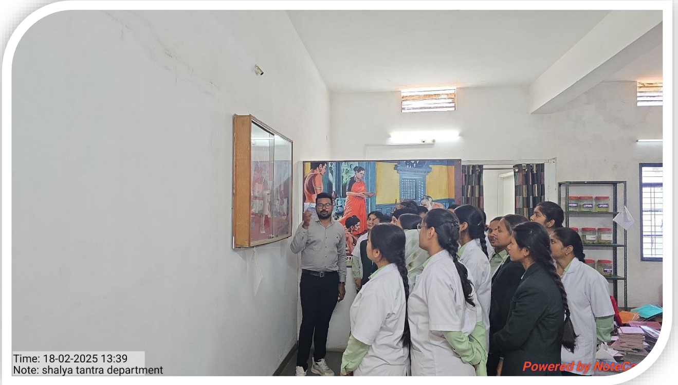
Time: 18-02-2025 13:39 Note: shalya tantra department